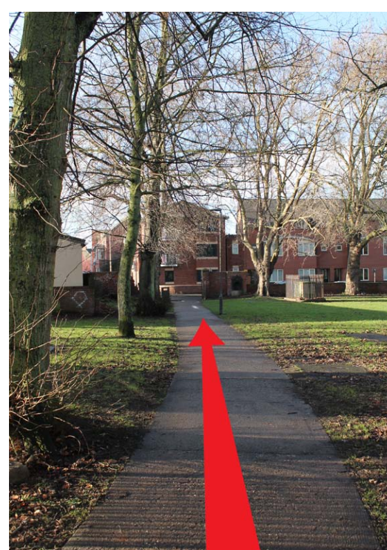
You will see steps up into a park, follow the path through the park until you reach a road.