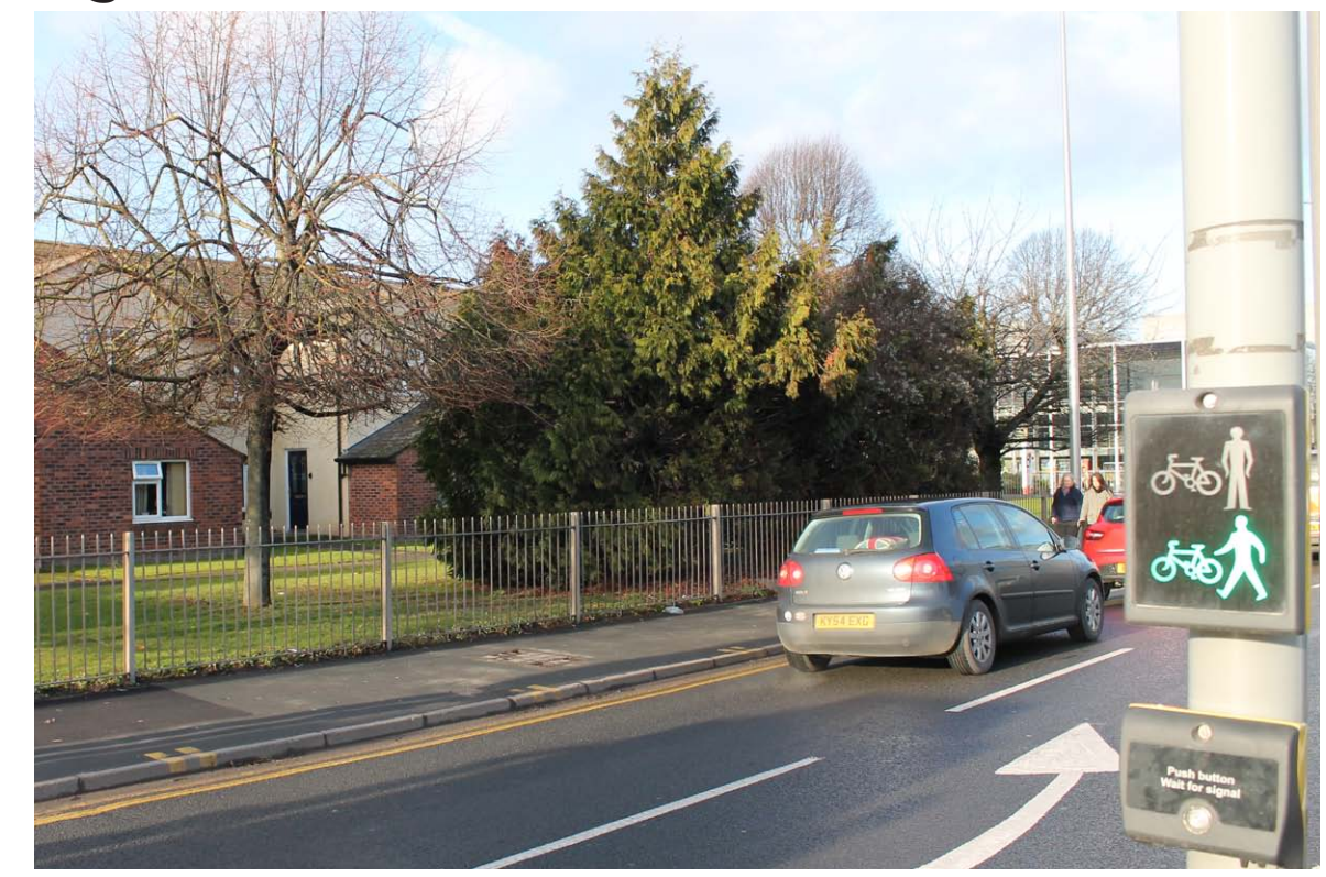
Make sure to wait until the second set of lights display the signal to cross . Now turn right and walk up Edgar Street.