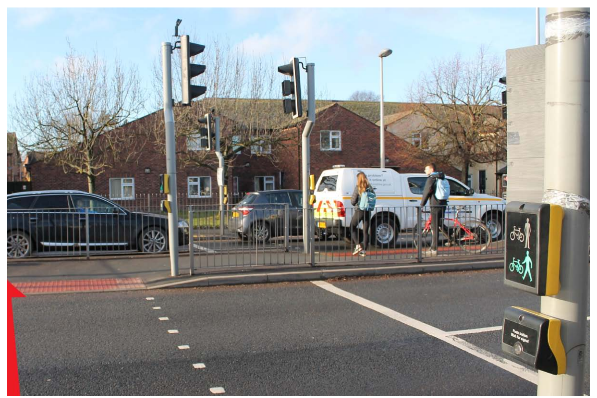
Continue along Blackfriars Street until you reach another pedestrian crossing. Press the button and wait for the signal to cross.