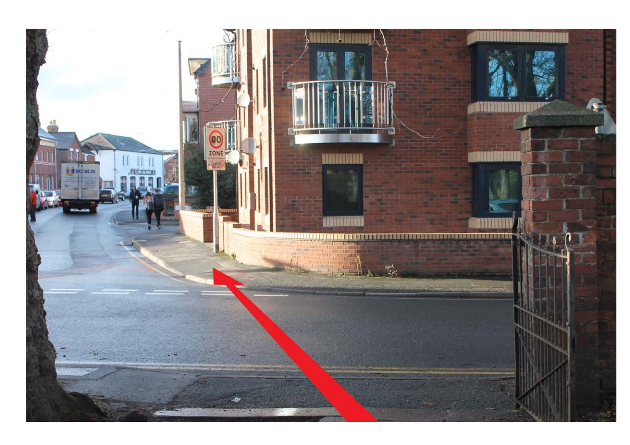
There is no pedestrian crossing here - wait until you are sure it's safe and cross the road carefully.