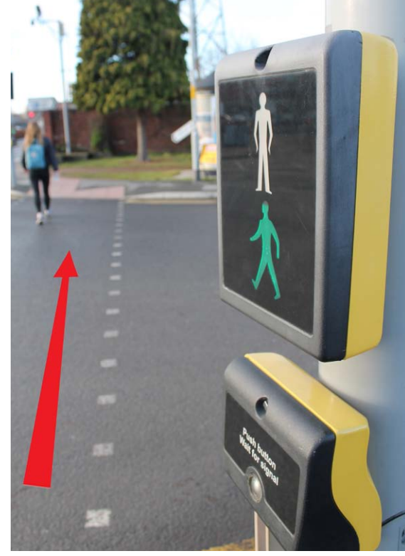
Turn right onto Blackfriars Street and walk until you reach a pedestrian crossing press the button and wait for the signal to cross.