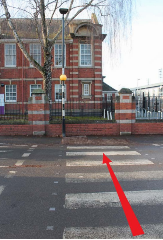
Cross the Zebra Crossing and walk left back down Widemarsh Street.