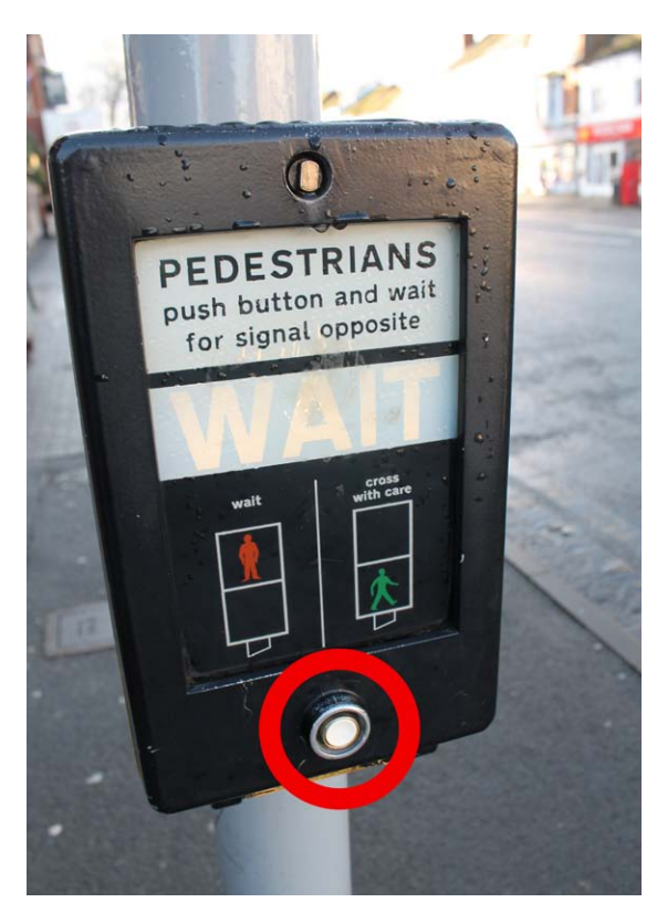
When you arrive at the bus you will leave and cross Commercial Road - press the button and wait for the signal to cross.