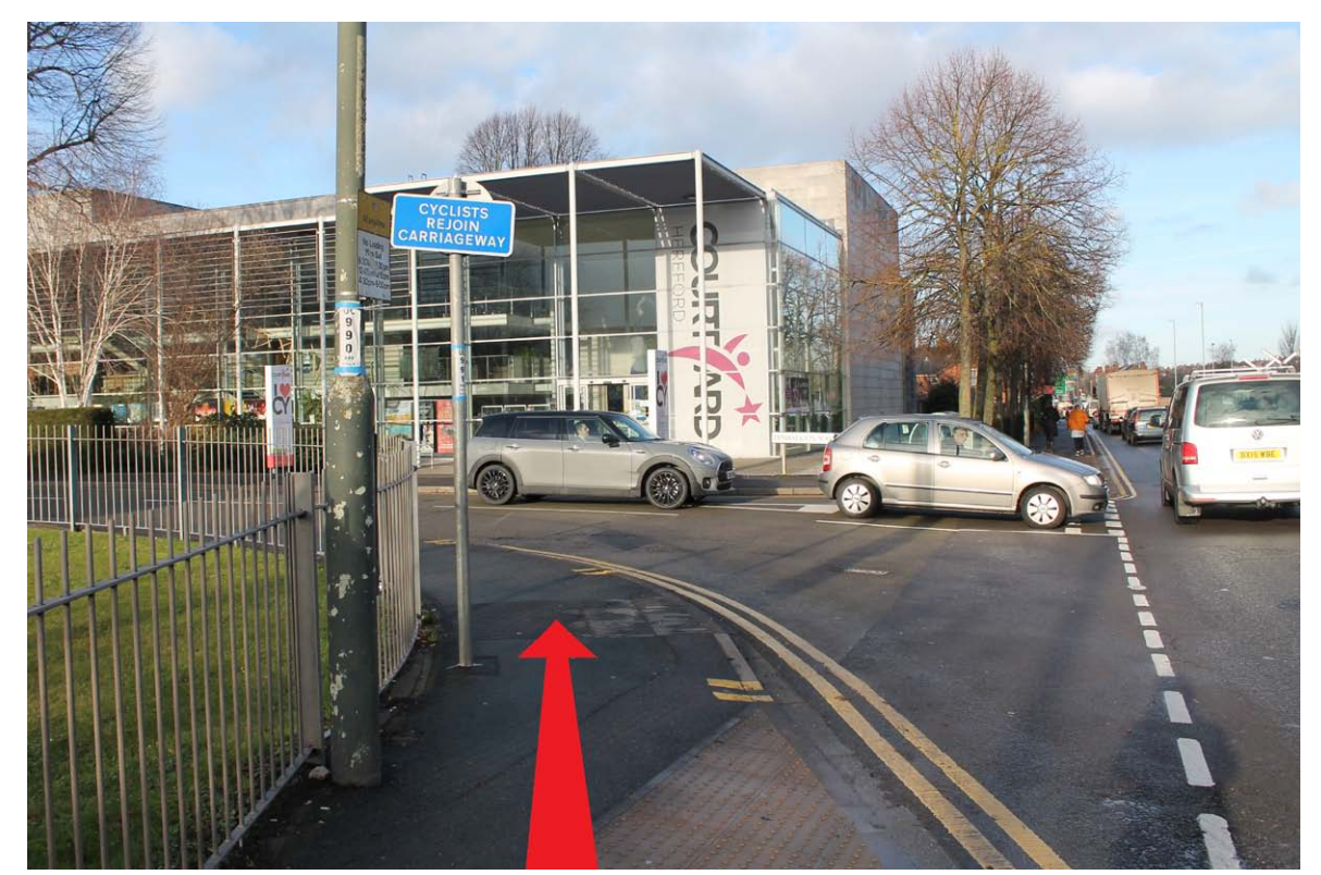
Walk up Edgar Street until you see The Courtyard There is no pedestrian crossing here - wait until you are sure it's safe and cross the road carefully