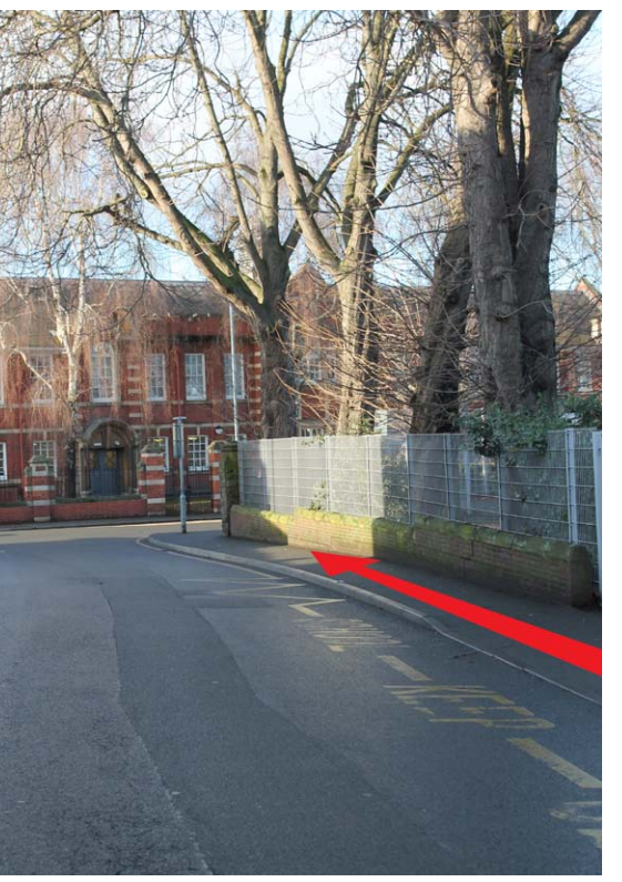
Follow the road past the school then go right onto Widemarsh Street - walk until you see a Zebra Crossing .